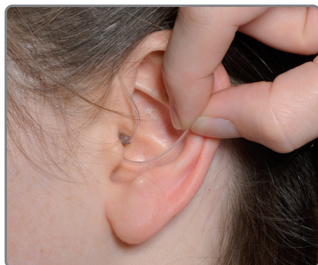
Fold the tail (c) backwards into the bowl of the ear if you have this on your hearing aid.