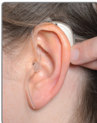
Place the hearing aid behind your ear.