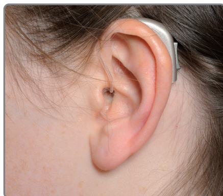
This is how a correctly fitted hearing aid should look.