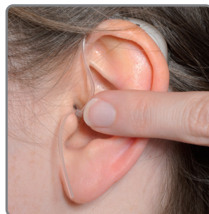
Push the soft tip (b) into your ear canal so that the tube lies flat against the side of your ear